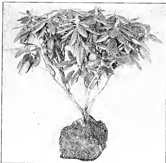
Specimen Rhododendron. Large bushy plants, transplanted last spring. Each plant dug with a ball.

These Pyramidal Arbor-Vitæ are extra fine plants, several times sheared and transplanted. They would be dug with a ball and the ball sewed in burlap, insuring success in transplanting. If customers do not care to have them with a ball, they will be supplied at 10c. per tree less than prices quoted, but this will not be done unless expressly stated in the order.